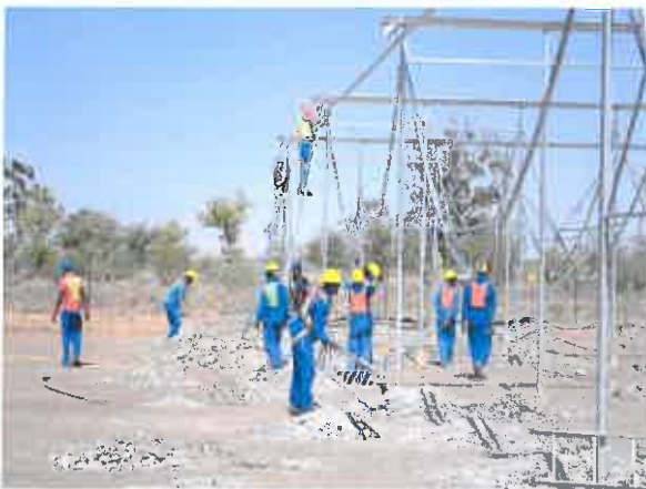
Job creation: workers at Emthanjeni Hydroponics